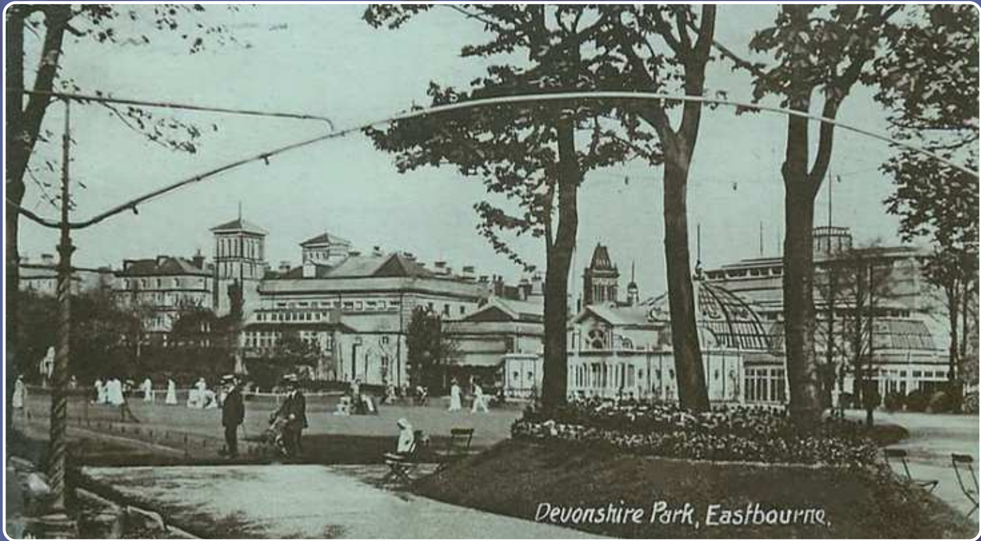
Devonshire Park, Eastbourne.